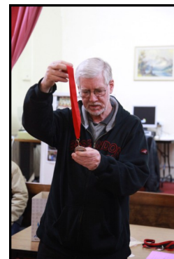
The organiser Thinking about the rate of play

How about an 8 player round robin at the top and the rest of us on 60min. plus 30 seconds