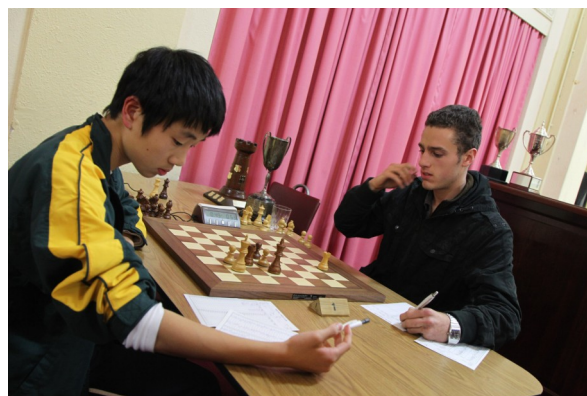
Round 3 Board 1 The final position

With late entries now in the tournament the head count stands at 66 which is the exact number that played last year. The feature however that gives concern to the organisers is that only 36 of last year's players are also playing this year